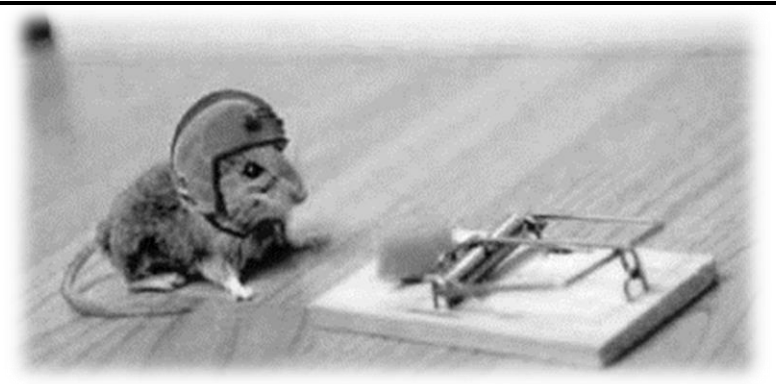
5. Calmly stand your ground.

Most employers will come back with a polite refusal of your offer. This may sound like the end of the conversation but it doesn't have to be. Don't back down. The key is to continue to show your enthusiasm and stay confident (NOT arrogant) in your abilities, try not to look at this as discouraging. Employers are very adept at negotiating and may actually welcome and anticipate a good negotiation session. Try once more.